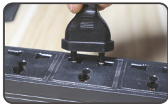
2. Power On.