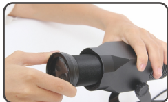
4. Screw in the zoom lens