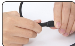
6. Screw in the heat sink and connect the male & female cable