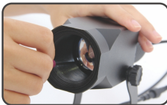
2. Rotate the optical lens by anticlockwise Effect: Image Bigger