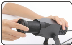
1. Screw out the zoom lens