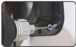
1. install screws to fix the projector