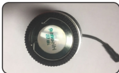
5. Install the new glass gobo (vertical direction upside down) then fix the jump spring