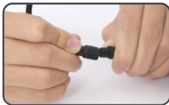
2. Depart the waterproof male & female cable