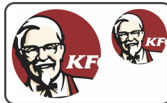
Effect at the same distance