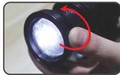
3. Adjust the image definition by rotating the zoom lens