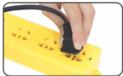
1. Power off