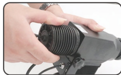
3. Screw out the heat sink