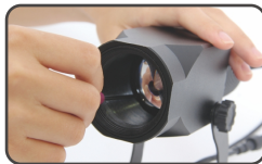
3. Rotate the optical lens by clockwise Effect: Image Smaller