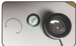
4. Loosen the jump spring and take out the old gobo